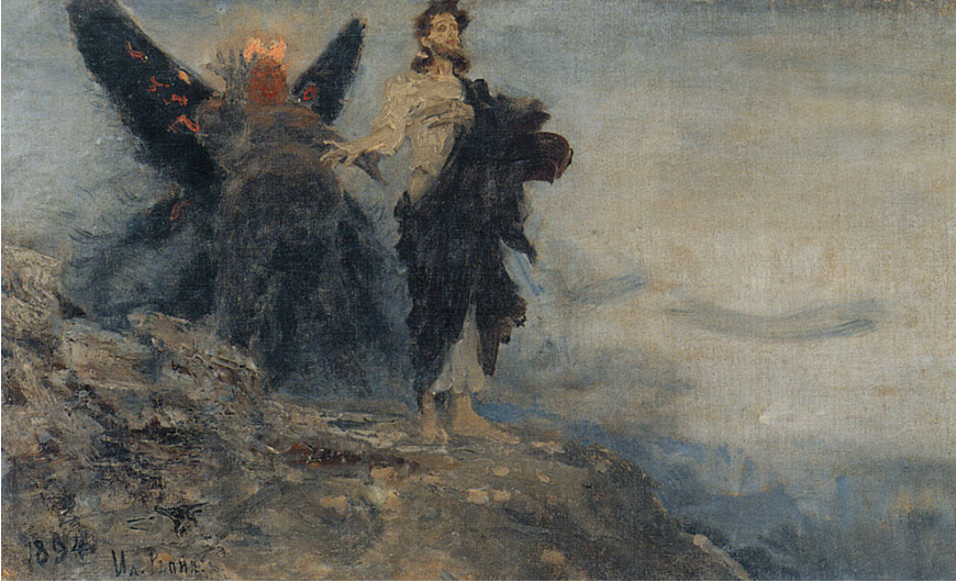
Get Behind me Satan by Ilya Repin